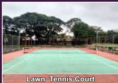
Lawn Tennis Court