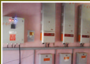
50KW Solar Power Plant at Engg. College