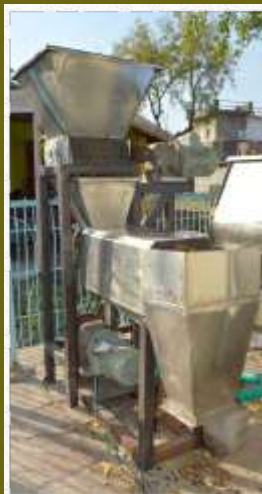
Solid Waste Management Plant at Engg. College