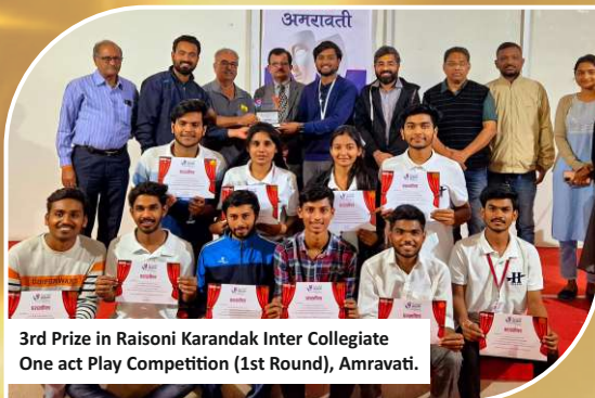
3rd Prize in Raisoni Karandak Inter Collegiate One act Play Competition (1st Round), Amravati.