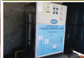
Reverse Osmosis water Purification