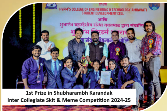
1st Prize in Shubharambh Karandak Inter Collegiate Skit & Meme Competition 2024-25