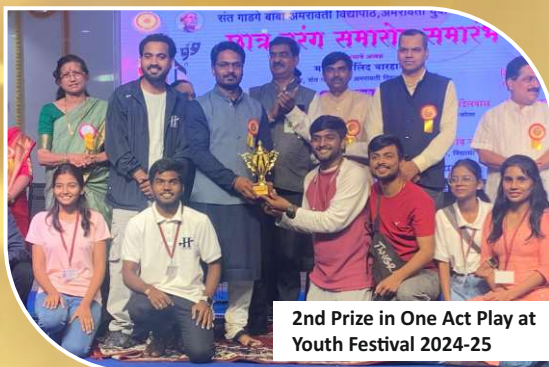
2nd Prize in One Act Play at Youth Festival 2024-25