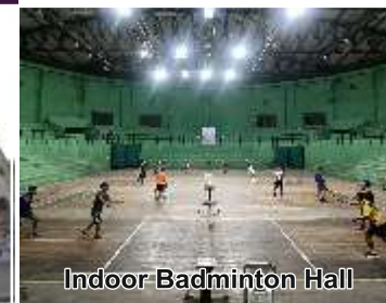
Indoor Badminton Hall