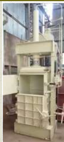
Plastic Compaction Unit