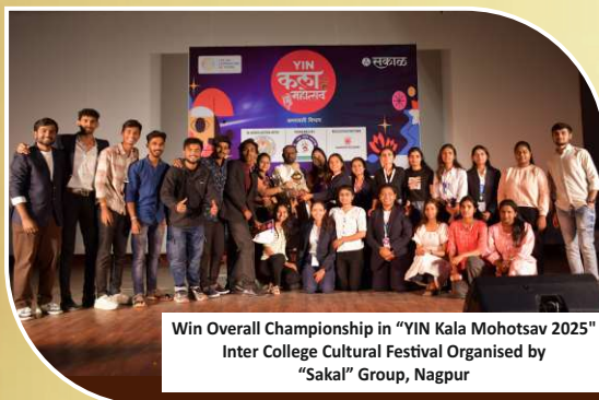
Win Overall Championship in "YIN Kala Mohotsav 2025" Inter College Cultural Festival Organised by "Sakal" Group, Nagpur