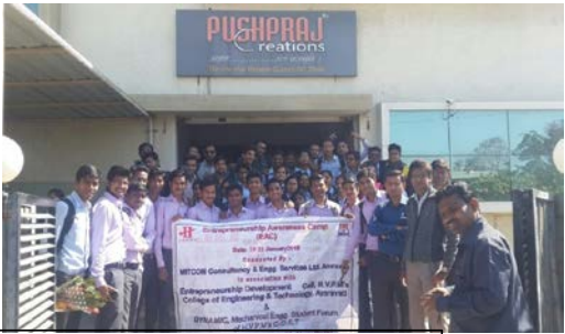
PUSH PRAJ Creations