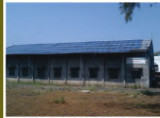
50KW Solar Power Plant at Engg. College