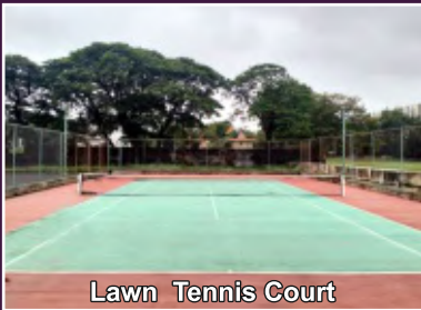
Lawn Tennis Court