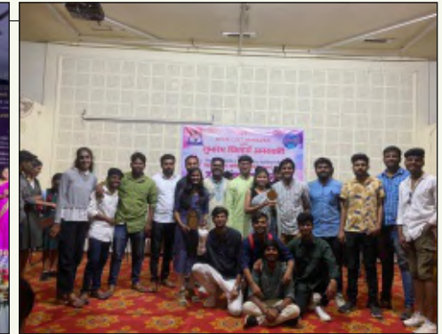
1st Prize in Mime शुभारंभ करंडक