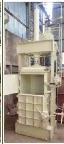
Plastic Compaction Unit