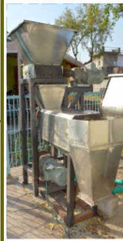
Solid Waste Management Plant at Engg. College