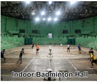
Indoor Badminton Hall