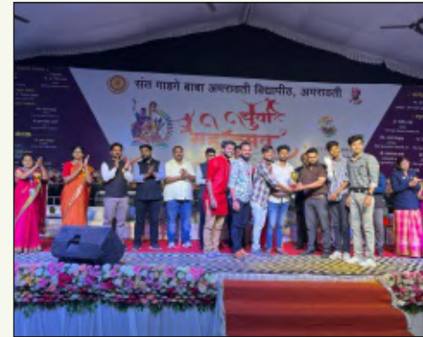
Youth Festival - 2023 - 2nd Prize