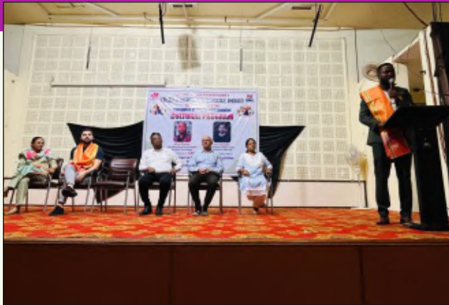
Delegates of Russia and Eswatini - Interaction with students of COET