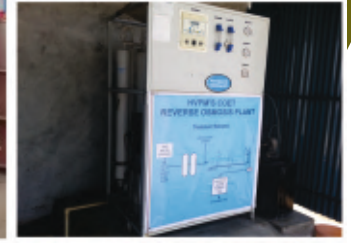
Reverse Osmosis water Purifi