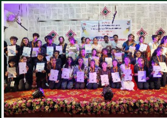
Theater Acting Workshop