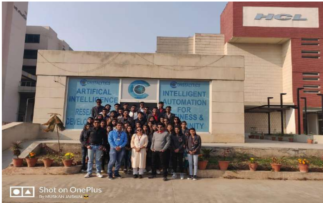
Shot on OnePlus By MUSKAN JAISWAL 🇮🇳