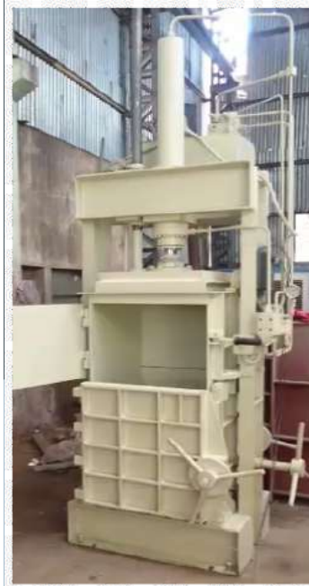
Plastic Compaction Unit