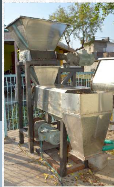
Solid Waste Management Plant at Engg. College