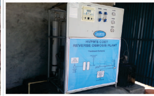
Reverse Osmosis water Purification Plant