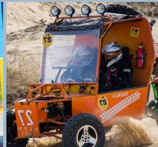
HVPM - COET, AMRAVATI