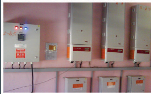
50KWP Solar Power Plant at Engg. College