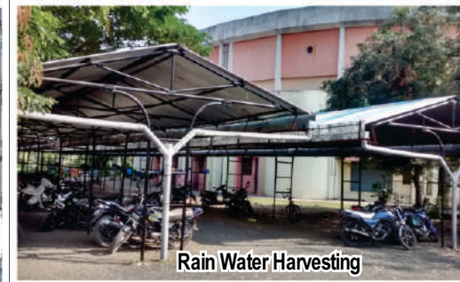
Rain Water Harvesting