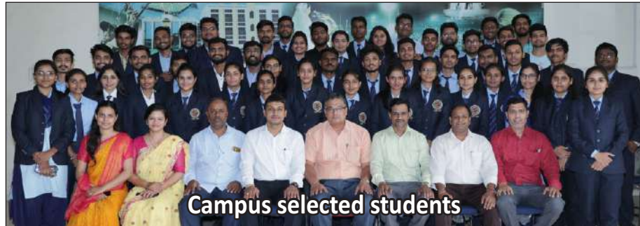
Campus selected students